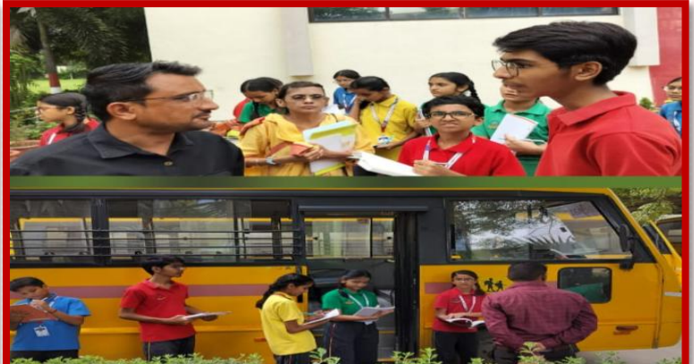
Environmental Audit Conducted by Team GenCan