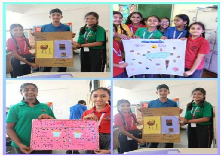
Sugar Board Activities

On 28 th June, Abhinandan Felicitation Event was held. Toppers and 90% above students of Grade 10 & 12 along with their Principal Ma'am, escort teachers and parents attended the event.