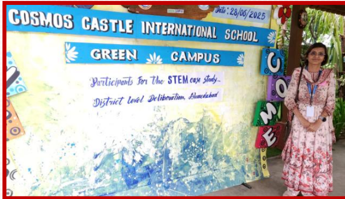
STEM DLD Competition

On 10 th July, young Davian's enthusiastically celebrated Van Mahotsav in their classrooms by planting saplings, making posters, and sharing messages on tree conservation, fostering awareness and love for nature among students.